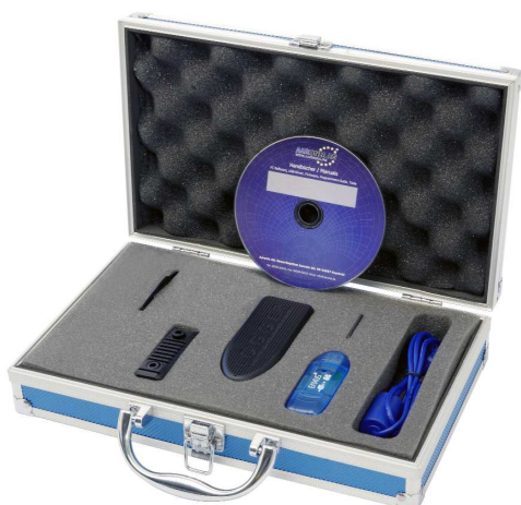
Scope of delivery